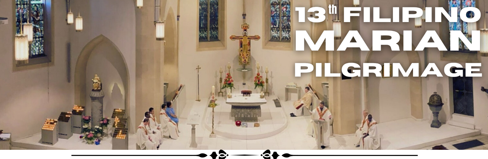
May 4, 2024 Cistercian Monastery, Am Varenholt 9, Bochum-Stiepel, Germany